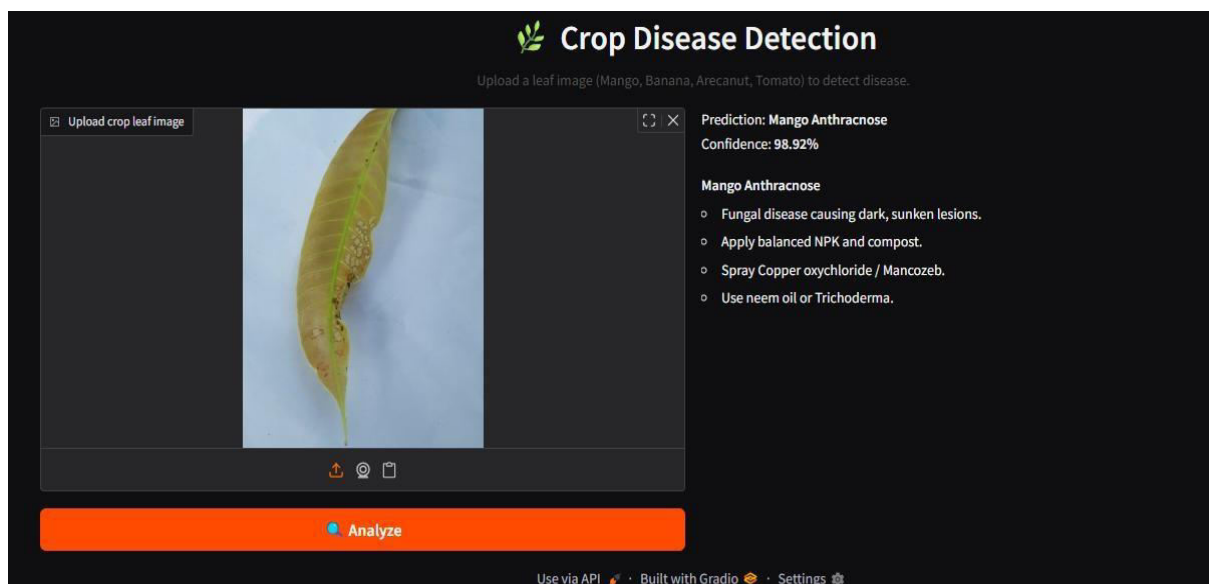
Figure 2: Disease Detected in Uploaded Photo